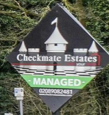
The Croft, Wembley, HA0 3EQ Asking Price £400,000